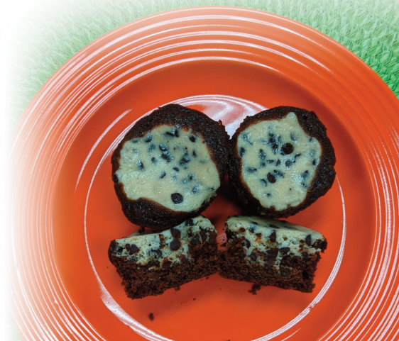
>> "Anything is good if it's made of chocolate! This cupcake is gooey when still warm. Delicious!"

Fill lined cupcake holders 1/2 full with the chocolate mixture, put a spoonful of the cream cheese mixture on top. Bake at 350 for about 20 minutes, don't over bake.