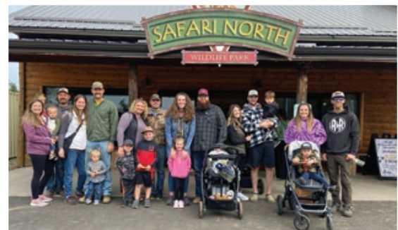
Don't miss the Celebrate YOU at the Zoo event in September. Free admission!

steadfast. Each event is a chance to celebrate our cooperative spirit and the incredible community we've built together.